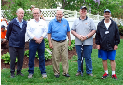
Ocean View Town Council