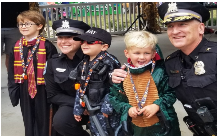
2019—5th Annual Cops and Goblins!