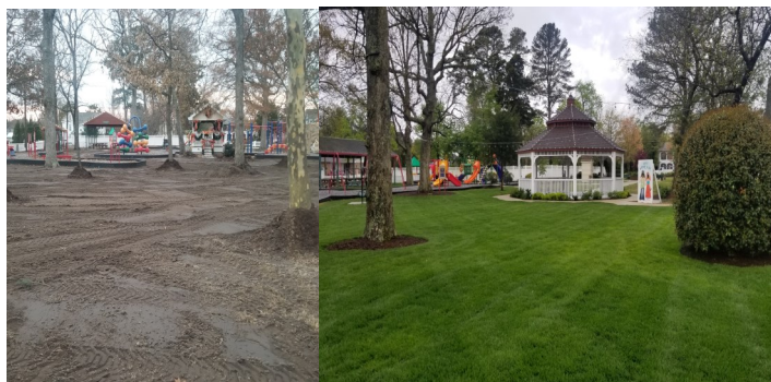
John West Park , before & after pictures of the new turf!