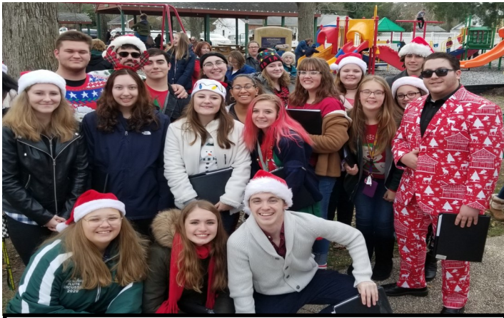
Shout out to the Indian River High School Choir for their participation at our Old Town Holiday Market and Tree Lighting !