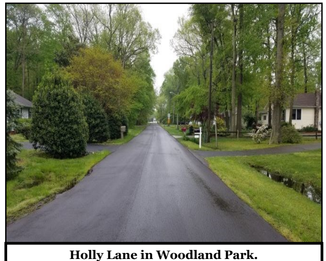
Holly Lane in Woodland Park.

The mosquito control plan for the Town of Ocean View is comprised of two distinct operations including DNREC and the Ocean View Public Works staff that collaborate to provide a comprehensive treatment plan. Treatment is contingent upon acceptable weather at the time of our applications. Larvae treatments have already begun, and weekly mosquito spraying will commence the end of May and continue until the end of September. Spraying will take place on Wednesday and Friday mornings between 2:30 and 6:00am.