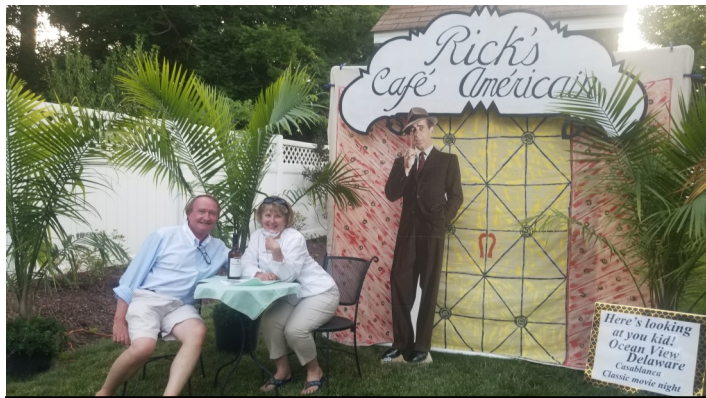
Summer of 2019 Movie Theme Night Fun!